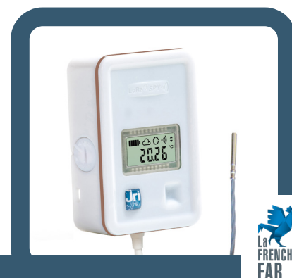
Non contractual photo

Standard measuring instrument for the LoRa® SPY range sensors